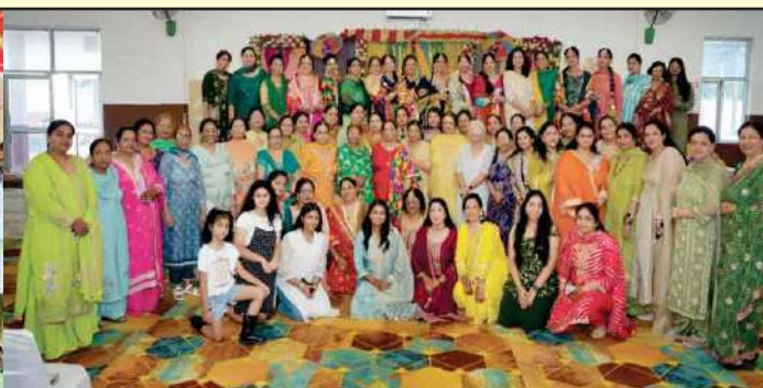
सूद सभा होशियारपुर द्वारा दिनांक 25 जूलाई को जनहित में वार्षिक भण्डारे का आयोजन और तीज त्यौहार का धूमधाम से मनाया जाना।