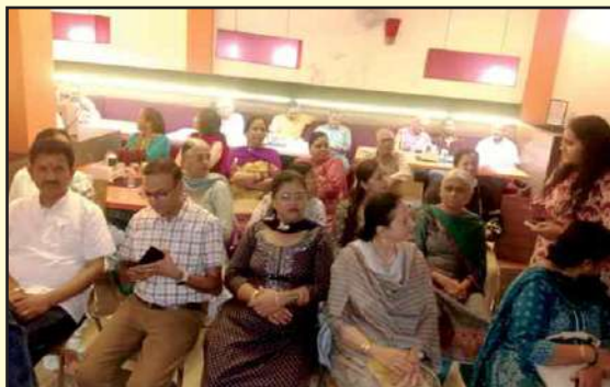
सूद सभा परवाणू द्वारा 21 जूलाई को मैगों मेला का आयोजन ।