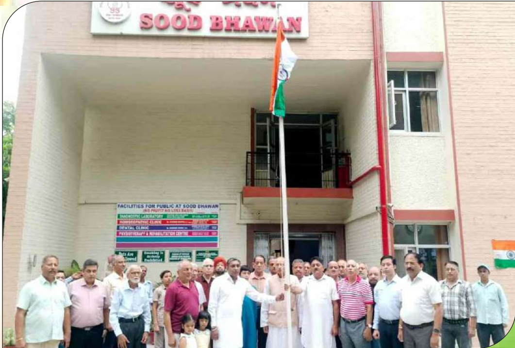
Flag hoisting on Independence Day at Sood Bhawan, Sector 44 A, Chandigarh

• Sood Sandesh ₹ 500/- (Membership for ten years)