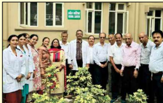
सूद सभा, पालमपुर द्वारा पर्यावरण संरक्षण की दिशा में पौधारोपण अभियान।